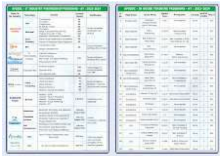
Training Programs APSSDC.jpeg 422K