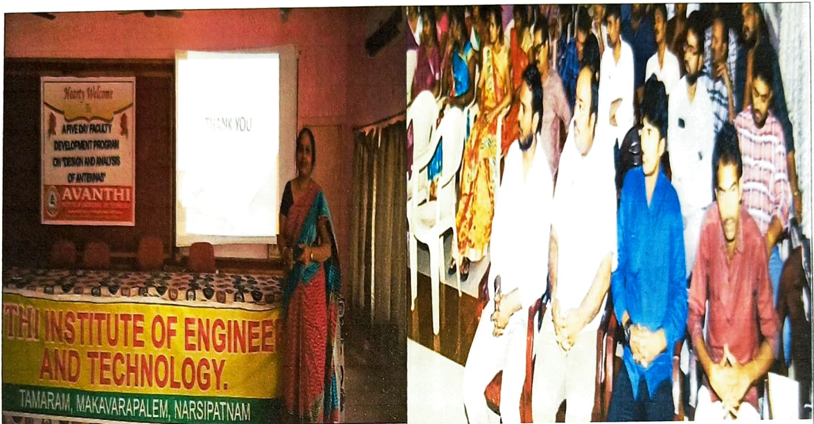
Participants and resource person attended a five day faculty development program on “ Design and Analysis of Antennas”

Name of the program : Design and Analysis of Antennas Date/s : 30-04-2018 to 04-05-2018 Organized by : Department of Electronics & Communication Engineering