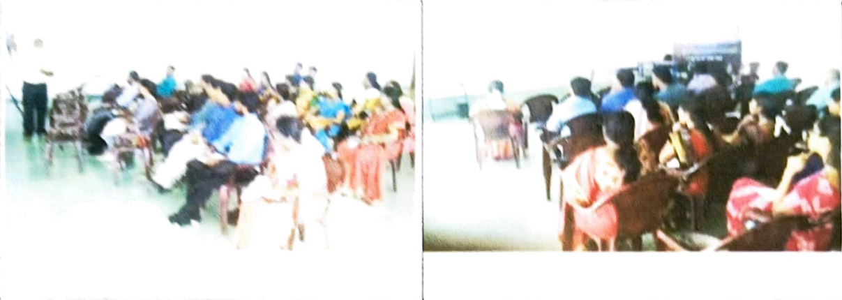
Participants and resource person attended a five day faculty development program on "Bio Inspired Optimization Techniques for Electrical Engineering Applications"

Organized by : Department of Electrical & Electronics Engineering